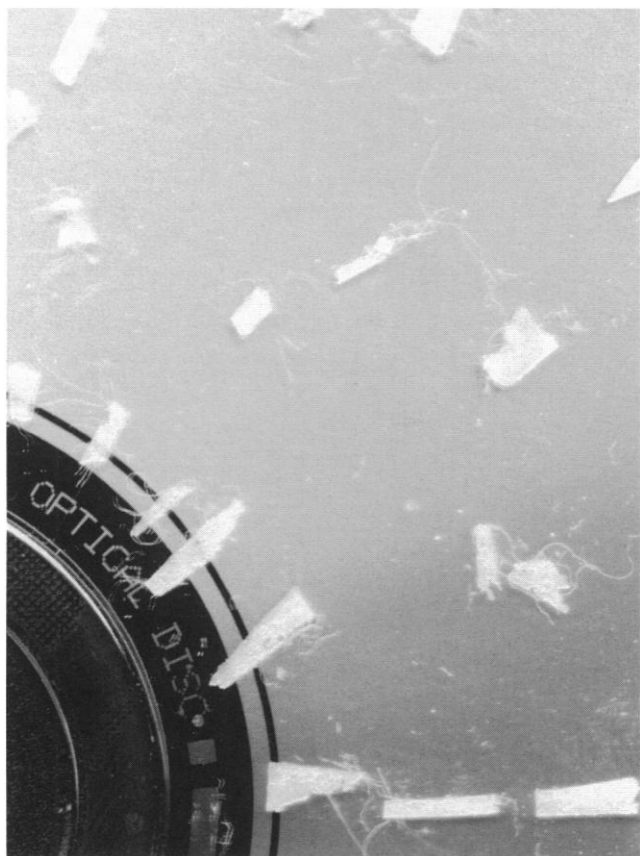
Fig. 1. Yasunao Tone, Wounded Compact Discs. Tone placed tape on the surfaces of CDs, “wounding” them before playing in a regular CD player.

their conversations without the noise. What could be worse than the sound of a skipping, glitching CD?